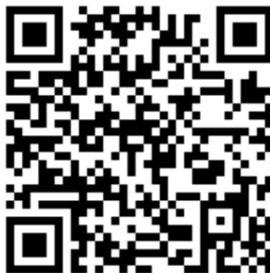
Figure 6 – Example QR code

Figure 6 below shows an example of a QR code on EWS products.