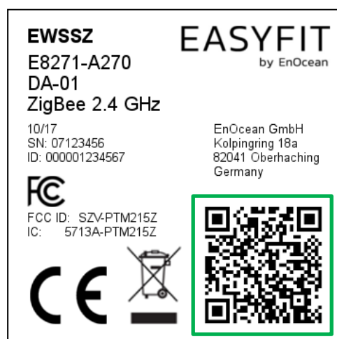
Figure 5 – Location of the commissioning QR code

Figure 5 below shows the device label and highlights (green rectangle) the location of the QR code.