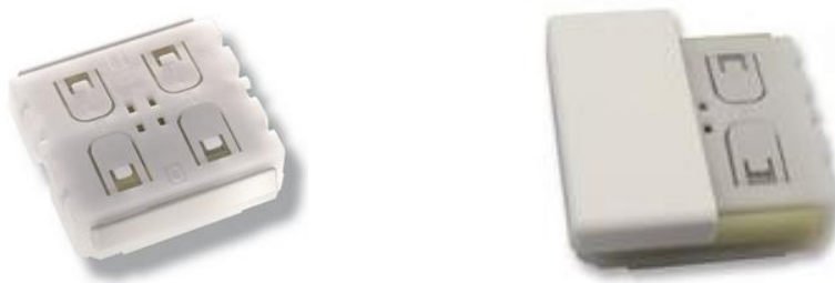
Figure 3 – PTM 21x module (shown with and without rocker)

EWS are implemented based on the EnOcean PTM 21x module which is shown below.