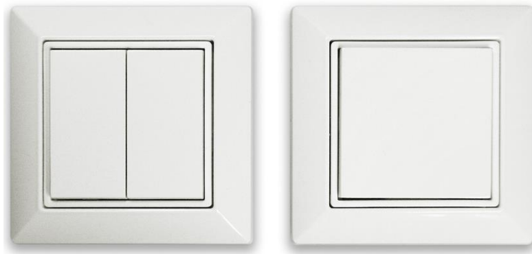
Figure 1 – EWSSZ / EWSSZG (single rocker) and EWSDZ / EWSDZG (double rocker)

Figure 1 below shows the single rocker (EWSSZ or EWSSZG) and double rocker (EWSDZ or EWSDZG) product variants.