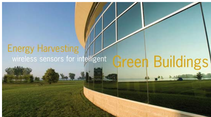
EnOcean stands for Intelligent Green Buildings

EnOcean based radio devices are used worldwide by well-known product manufacturers in their system solutions for intelligent, energy-efficient buildings. The EnOcean Alliance is a consortium of independent system integrators and leading manufacturers in the area of building automation. A strong, international alliance allows energy saving potentials and cost advantages to be widely and effectively communicated. The “intelligent green building” becomes a reality.