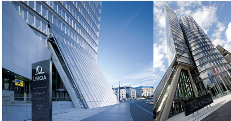
Uniqa company head offices in Vienna: 500 EnOcean radio-based room sensors on 22 floors

Similar observations are made in regard to air-conditioning systems. Each degree of increased room temperature results in more than 4% less energy requirement for cooling (source: LfU). The use of controls regulated by time, location and use based on effectively placed sensors (temperature, humidity, presence) is a trendsetting approach to ensuring energy savings and the protection of the environment.