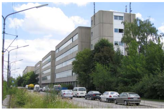
Siemens Munich: light and blind control in eleven office buildings using EnOcean radio sensors.

Inside blinds reduce glare. Contrary to outside shutters and blinds, however, they are not as effective in preventing the room from heating up in summer. Outside shutters and awnings thus reduce the energy requirement for air-conditioning systems, but also require flexible operation directly at the workplace or from the living room couch. Radio controls, therefore, win more and more recognition. Currently, a total of 25% of all electric roller blinds and 60% of all awnings in Europe are already operated by radio control (source: IO Homecontrol).