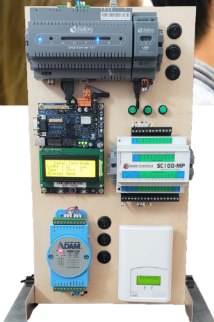
Pre-assembled panel with SmartServer IoT and typical industrial devices ships in a travel case