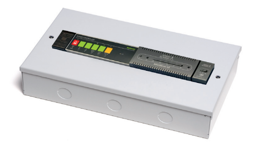
Delmatic's Smart IP Router with SmartServer IoT

SmartServer IoT plays a critical role in the stadium-wide lighting management system architecture, as part of Delmatic's Smart IP Routers that ensure open and seamless communication across the horizontal and vertical networks and optimize transmission of data. Within the Ahmad Bin Ali Stadium lighting control system, sixteen IP/LON routers control 584 LON nodes.