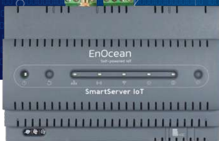
SmartServer IoT Edge Server built on open standards