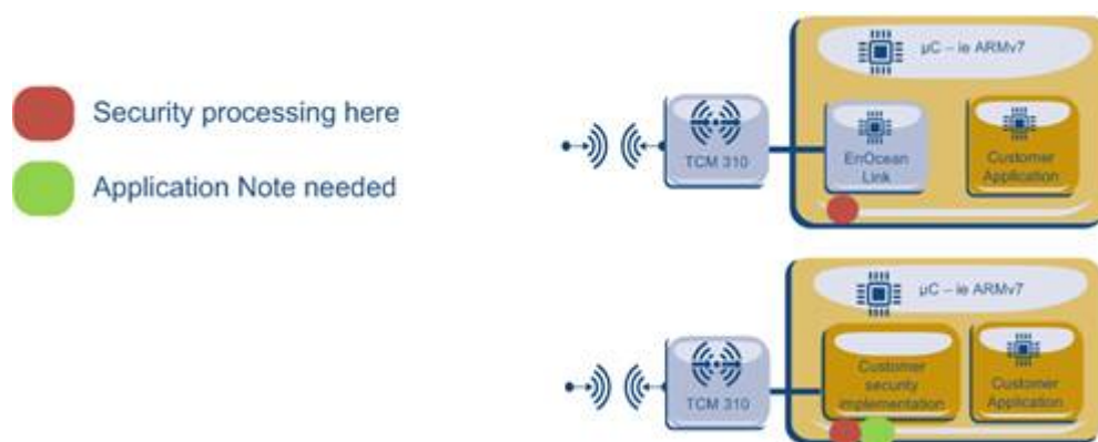
Figure 1 Gateway receiver Application

The typical architecture of a Gateway Application is listed below: