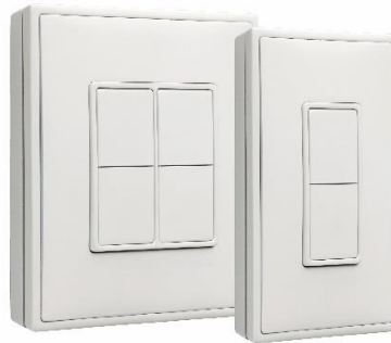
Energy Harvesting Powered Wireless Light Switches