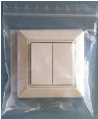
Easyfit Switch, single bag packaging

Easyfit switches are available in single packages with product documentation. Single packages are bags, they stacked into a 10 pcs cardboard box. For transportation, up to 21 of those 10 pcs boxes are packed in one transport cardboard box.