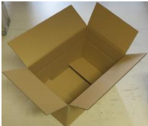
Easyfit Transport box (475x310x300mm)