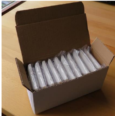
Easyfit 10 pcs box (200x90x90mm)